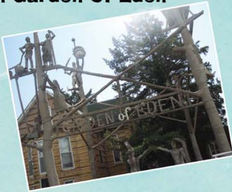
Build Your Own Garden Of Eden